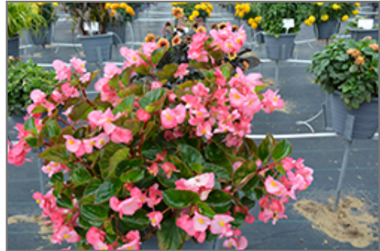
Big Pink Green Leaf Begonia in bloom

Big Pink Green Leaf Begonia is a fine choice for the garden, but it is also a good selection for planting in outdoor containers and hanging baskets. It is often used as a 'filler' in the 'spiller-thriller-filler' container combination, providing a mass of flowers and foliage against which the larger thriller plants stand out. Note that when growing plants in outdoor containers and baskets, they may require more frequent waterings than they would in the yard or garden.