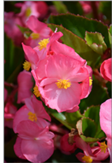
Big Pink Green Leaf Begonia flowers

This is a high maintenance plant that will require regular care and upkeep, and usually looks its best without pruning, although it will tolerate pruning. Deer don't particularly care for this plant and will usually leave it alone in favor of tastier treats. Gardeners should be aware of the following characteristic(s) that may warrant special consideration;