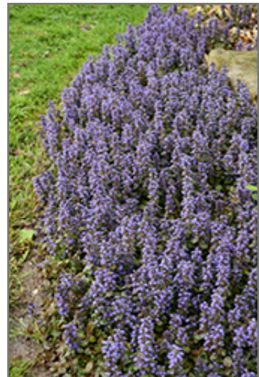
Caitlin's Giant Bugleweed