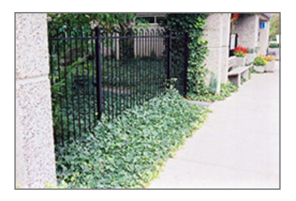
English Ivy

940 Montauk Highway Bayport, New York web: bayportflower.com phone: 1-800-729-0822