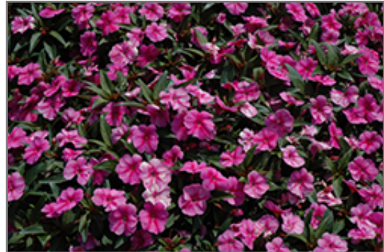
Bounce Pink Flame Impatiens flowers