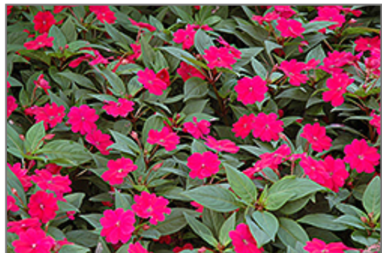
Bounce Cherry Impatiens in bloom