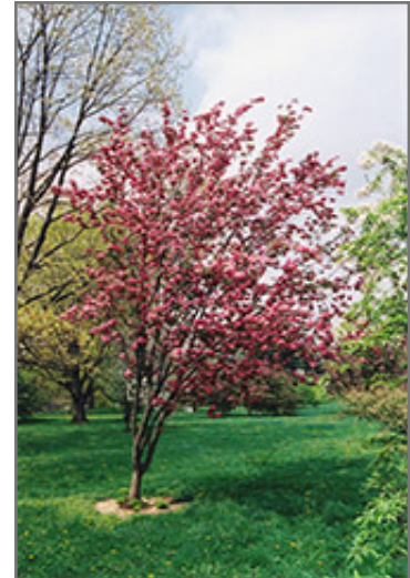
Red Baron Flowering Crab flowers

Red Baron Flowering Crab is recommended for the following landscape applications;