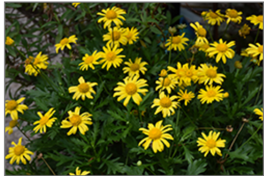
Sonnenschein African Bush Daisy flowers