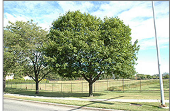
Norway Maple