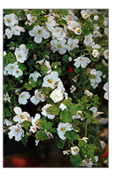
Calypso Jumbo White Bacopa flowers