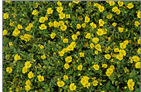
Magic Carpet Yellow Mecardonia flowers

Magic Carpet Yellow Mecardonia is recommended for the following landscape applications;