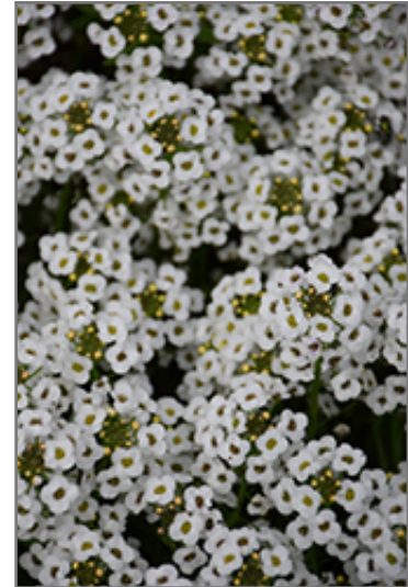
Stream White Sweet Alyssum flowers

Stream White Sweet Alyssum is recommended for the following landscape applications;