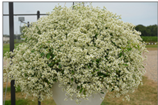
Stardust Super Flash Euphorbia in bloom