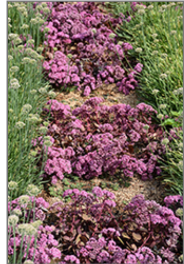
Cherry Tart Stonecrop in bloom

Cherry Tart Stonecrop is a dense herbaceous perennial with an upright spreading habit of growth. Its medium texture blends into the garden, but can always be balanced by a couple of finer or coarser plants for an effective composition.