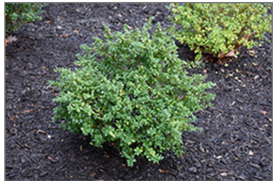
Green Lustre Japanese Holly