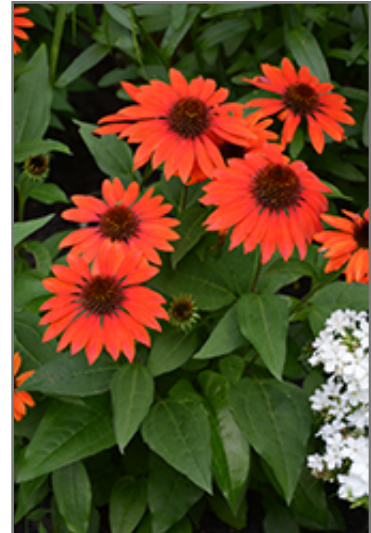
Sombrero Flamenco Orange Coneflower in bloom

Sombrero Flamenco Orange Coneflower is recommended for the following landscape applications;