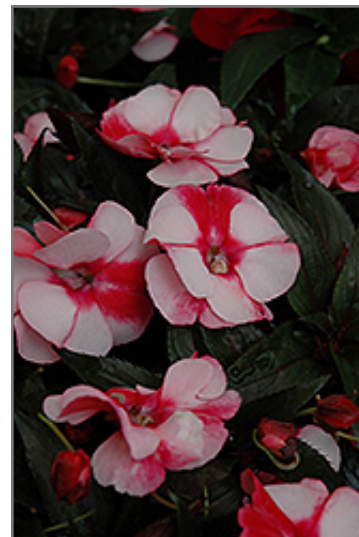
Sonic Sweet Cherry New Guinea Impatiens flowers