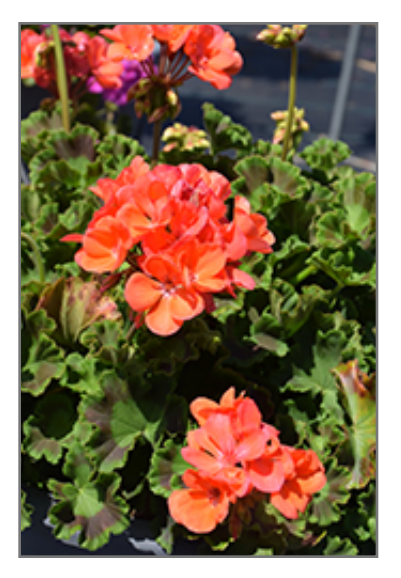
Rocky Mountain Salmon Geranium flowers

940 Montauk Highway Bayport, New York web: bayportflower.com phone: 1-800-729-0822