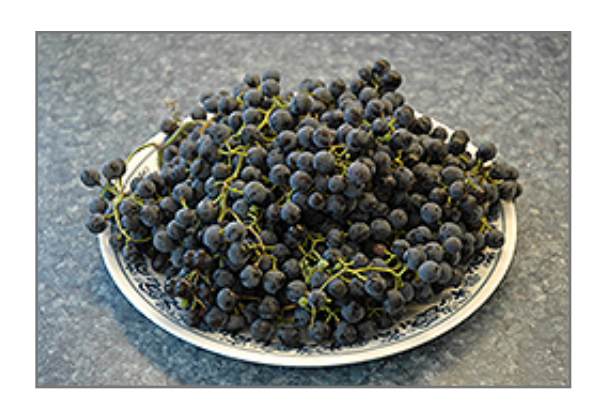
Frontenac Grape fruit

This is a dense multi-stemmed deciduous woody vine with a spreading, ground-hugging habit of growth. Its relatively coarse texture can be used to stand it apart from other landscape plants with finer foliage. This is a high maintenance plant that will require regular care and upkeep, and requires a special pruning regimen to reliably produce fruit; consult a specific reference guide or contact the store for proper pruning techniques. It is a good choice for attracting birds to your yard. Gardeners should be aware of the following characteristic(s) that may warrant special consideration;