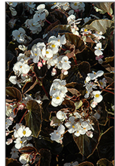
BabyWing White Bronze Leaf Begonia flowers