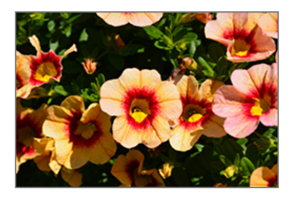
Hula Gold Calibrachoa flowers

940 Montauk Highway Bayport, New York web: bayportflower.com phone: 1-800-729-0822