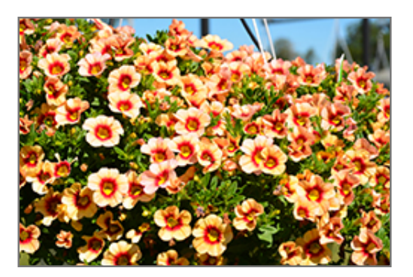
Hula Gold Calibrachoa flowers

Hula Gold Calibrachoa is recommended for the following landscape applications;