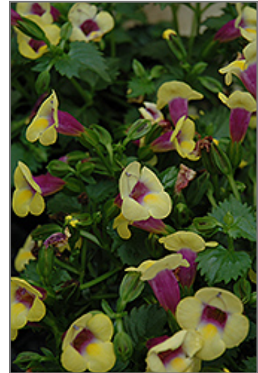
Yellow Moon Torenia flowers

Yellow Moon Torenia is recommended for the following landscape applications;