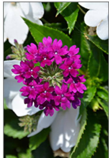
Superbena Royale Plum Wine Verbena flowers