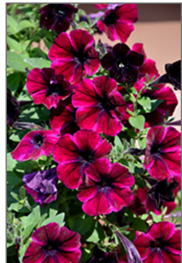
Sweetunia Johnny Flame Petunia flowers