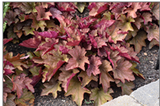
Carnival Watermelon Coral Bells