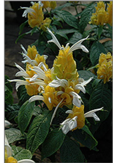
Golden Shrimp Plant flowers