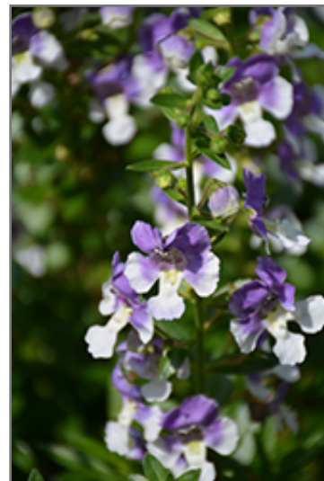
Angelface Wedgewood Blue Angelonia flowers