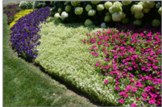
Frosty Knight Alyssum in bloom

Frosty Knight Alyssum will grow to be only 6 inches tall at maturity, with a spread of 18 inches. When grown in masses or used as a bedding plant, individual plants should be spaced approximately 15 inches apart. Its foliage tends to remain low and dense right to the ground. This fast-growing annual will normally live for one full growing season, needing replacement the following year.