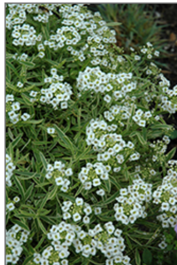
Frosty Knight Alyssum flowers

Frosty Knight Alyssum is recommended for the following landscape applications;