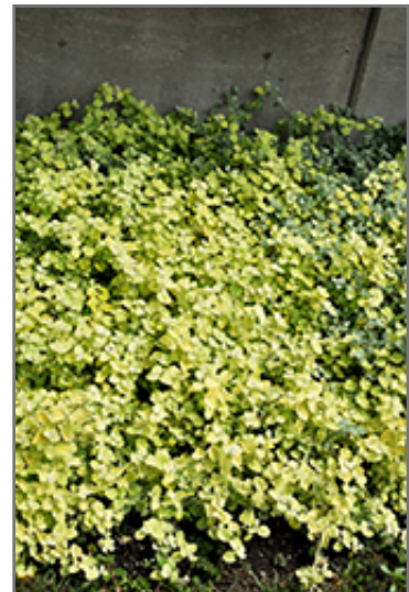
Lemon Licorice Plant