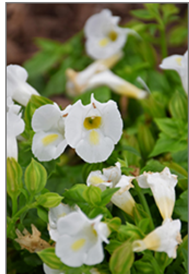
Catalina White Linen Torenia flowers