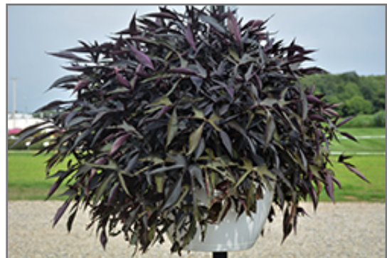
Illusion Midnight Lace Sweet Potato Vine