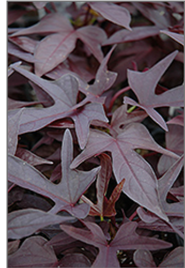
Sweet Caroline Raven Sweet Potato Vine foliage

Sweet Caroline Raven Sweet Potato Vine will grow to be about 8 inches tall at maturity, with a spread of 5 feet. Its foliage tends to remain low and dense right to the ground. This fast-growing annual will normally live for one full growing season, needing replacement the following year.