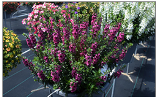
Archangel Raspberry Angelonia in bloom