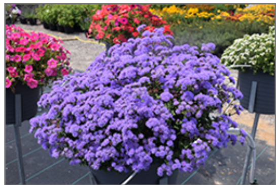
Artist Blue Flossflower in bloom