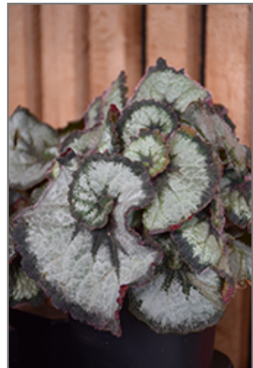
Escargot Begonia foliage