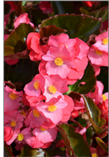
Big Rose Bronze Leaf Begonia flowers

Big Rose Bronze Leaf Begonia is recommended for the following landscape applications;