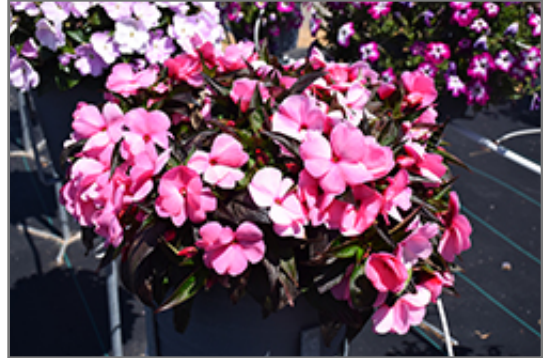
Sonic Light Pink New Guinea Impatiens in bloom

Sonic Light Pink New Guinea Impatiens is a fine choice for the garden, but it is also a good selection for planting in outdoor containers and hanging baskets. It is often used as a 'filler' in the 'spiller-thriller-filler' container combination, providing a mass of flowers against which the thriller plants stand out. Note that when growing plants in outdoor containers and baskets, they may require more frequent waterings than they would in the yard or garden.