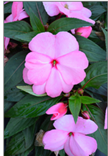
Sonic Light Pink New Guinea Impatiens flowers