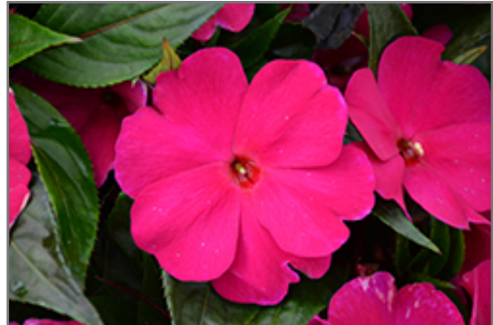
Magnum Purple New Guinea Impatiens flowers