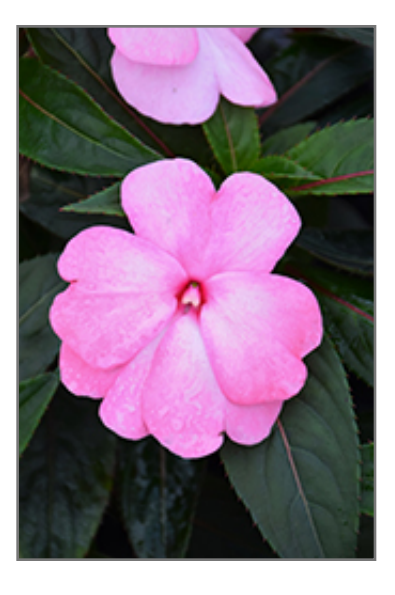
Super Sonic Pastel Pink New Guinea Impatiens flowers