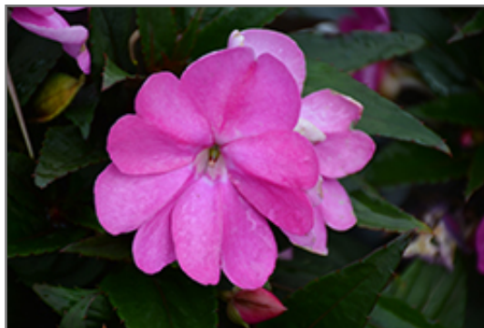
SunPatiens Compact Lilac New Guinea Impatiens flowers