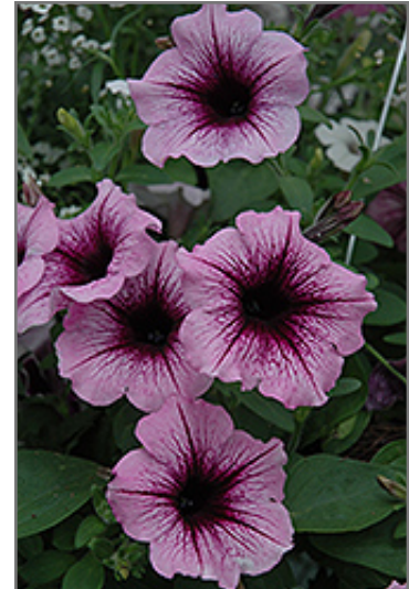
Supertunia Bordeaux Petunia flowers