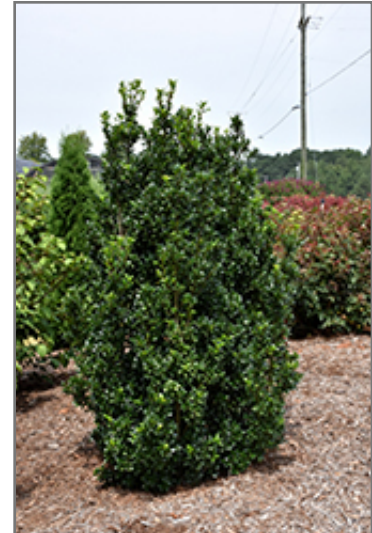
Castle Wall Meserve Holly