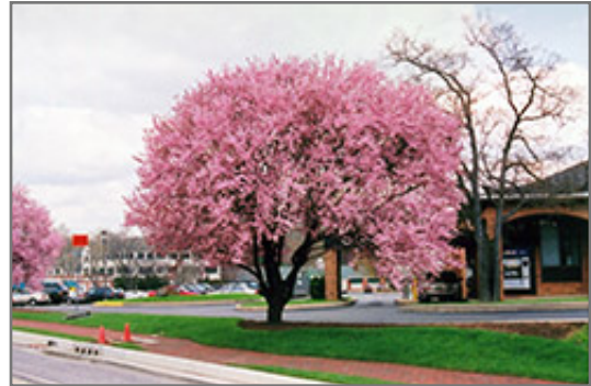
Thundercloud Plum in bloom

Thundercloud Plum is recommended for the following landscape applications;