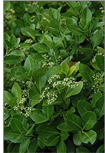
Manhattan Spreading Euonymus flowers

This shrub performs well in both full sun and full shade. It is very adaptable to both dry and moist locations, and should do just fine under average home landscape conditions. It is not particular as to soil type or pH. It is highly tolerant of urban pollution and will even thrive in inner city environments, and will benefit from being planted in a relatively sheltered location. This is a selected variety of a species not originally from North America.