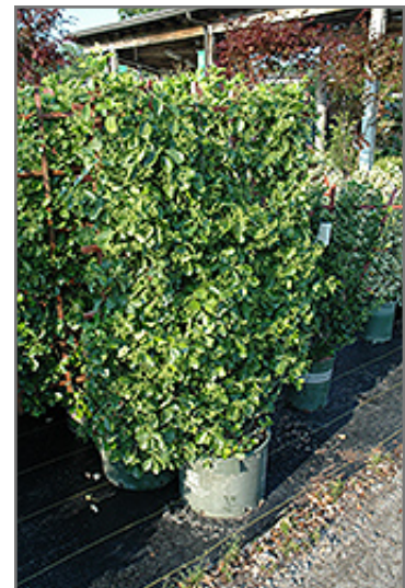
Manhattan Spreading Euonymus