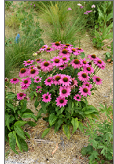
PowWow Wild Berry Coneflower in bloom

This is a relatively low maintenance plant, and is best cleaned up in early spring before it resumes active growth for the season. It is a good choice for attracting birds and butterflies to your yard, but is not particularly attractive to deer who tend to leave it alone in favor of tastier treats. It has no significant negative characteristics.