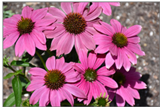
PowWow Wild Berry Coneflower flowers