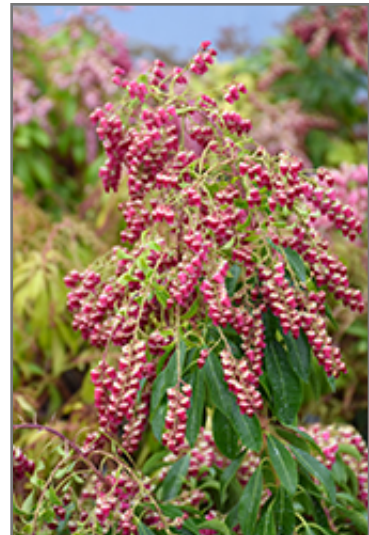
Valley Valentine Japanese Pieris flowers