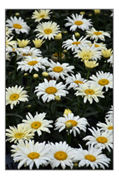
Amazing Daisies Banana Cream Shasta Daisy flowers