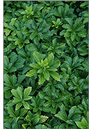
Green Sheen Japanese Spurge foliage