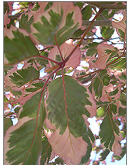
Tricolor Beech foliage